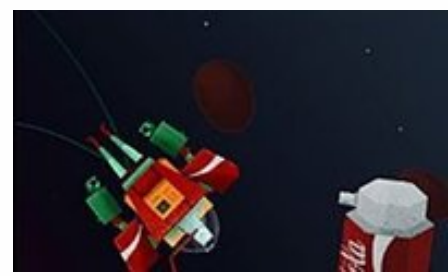
A Real-life David and Goliath Story blogs.artcenter.edu