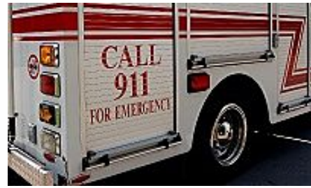
Tramadol Use May Up Risk of Hospitalization for HCPLive