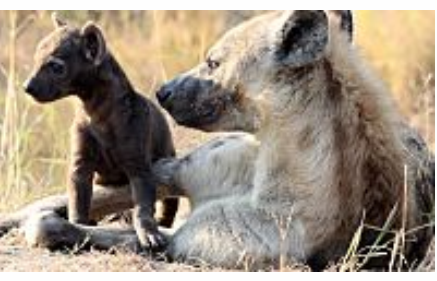
7 of the toughest baby animals From the Grapevine