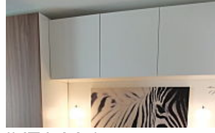
IKEA Makeover Turns Small DC Apartment Into a Racked DC

Restoring a Park Slope Wreck The New York Times