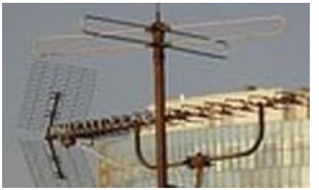
Your Cable Company Doesn't Want You To Know The Motley Fool