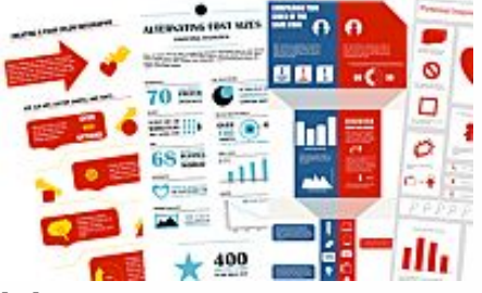
Mastering PowerPoint Infographics with HubSpot